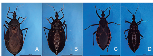
Fig. 2: the novel species of Triatoma sp. captured in Dali, Yunnan province (A back B ventral), T. rubrofasciata captured in Shunde, Guangdong province (C back D ventral).

kled, the top of it was slightly upwarping, oblique uplift in the centre of both sides (Fig. 1A-B). The conserved 16S ribosomal RNA gene, the Cytochrome b gene and 28S ribosomal RNA showed 93.08%, 77.16% and 91.55% similarities to T. rubrofasciata in GenBank, respectively. The sequences obtained from 16S rRNA of the Dali species were submitted to GenBank under the accession number MN200191. The phylogenetic trees were constructed using the 16S rRNA gene of the Dali species and other triatomines in GenBank and were based on the neighbor-joining method by MEGA6.0 (Molecular Evolutionary Genetics Analysis Version 6.0). The result showed that the Dali species fits in the same clade of T. rubrofasciata (Fig. 3). Morphological and molecular data suggest that it could be a novel Triatominae species. T. rubrofasciata specimens were collected mostly (1035/1041) inside human houses (60.9%) and domestic animal shelters. Most of the specimens (780/1041) were captured between July and August.