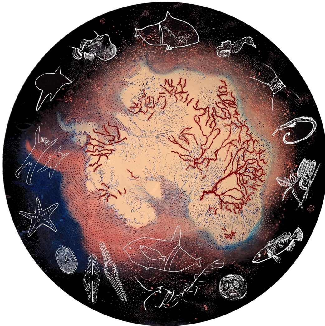
FIGURE 1 | Artwork signifies origins of this project in bringing together Australian Aboriginal perspectives and scientific data from Antarctica and the Southern Ocean. This illustrates pattern-matching between the Australian river catchments on the ice catchments and glacial flows of Antarctica.