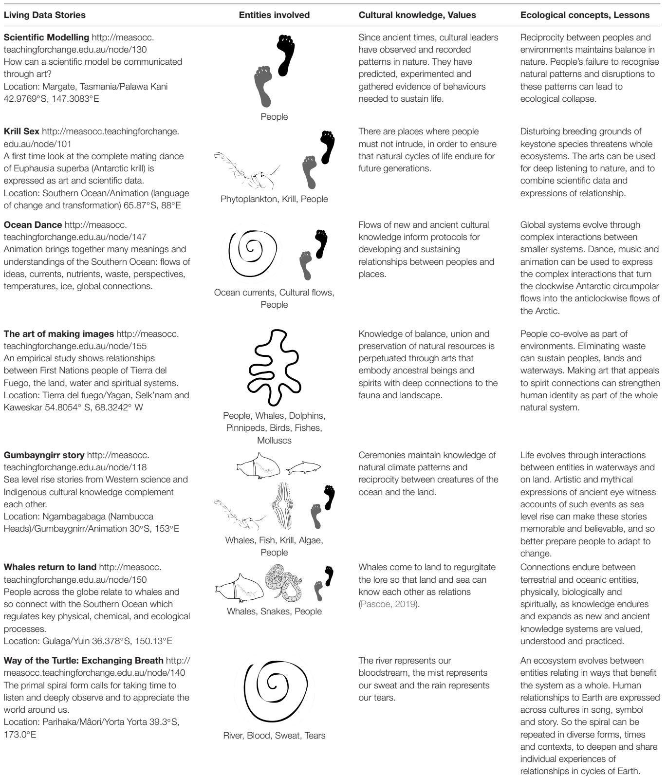
TABLE 1 | Stories conveyed through the interactive web-based map of MEASO Cultural Connections ( http://measocc.teachingforchange.edu.au/ ).