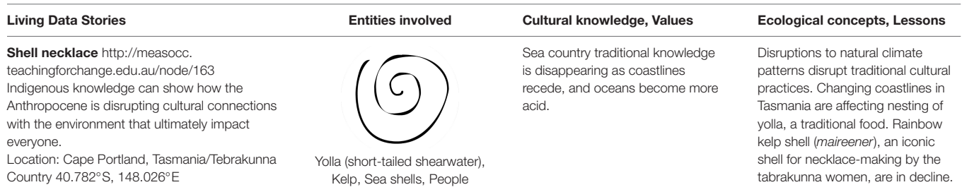
TABLE 1 | Continued

These stories have Indigenous, scientific, or artistic origins, each reaching into cultural traditions and values as well as providing ecological concepts and lessons. Links are to the pages underlying the map which provide the details and background of these stories. Location provides a description of the location and the approximate Latitude (decimal degrees) and Longitude (decimal degrees) from where these stories emanate and/or of where these stories relate.