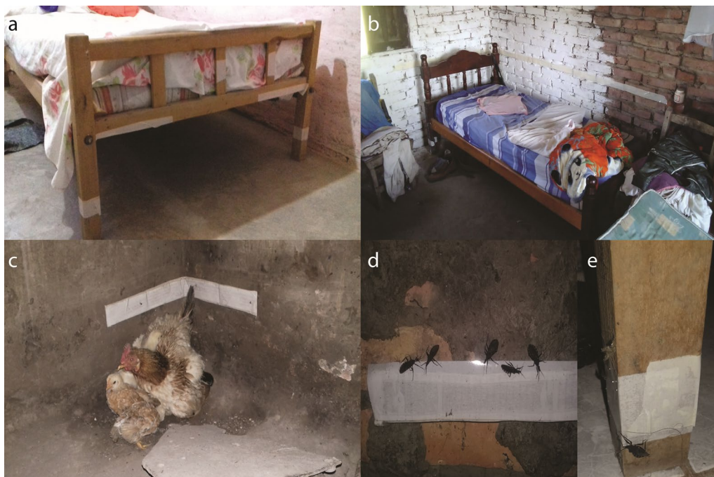
Fig. 1 Sticky traps installed in domiciles (a, b) and kitchens (c). Adults of Triatoma infestans captured by sticky traps (ST) installed on a wall (d) and a bed leg (e) in domiciles

Each ST was inspected for triatomines 1, 3 and 5 days post-installation in 42 houses, and 3–4 days post-installation in 12 houses that could not be accessed after a heavy rainfall. The evaluation of ST was restricted to 5 days post-installation because preliminary observations indicated that it lost adhesiveness thereafter. For ST, bug abundance per site was calculated as the total number of