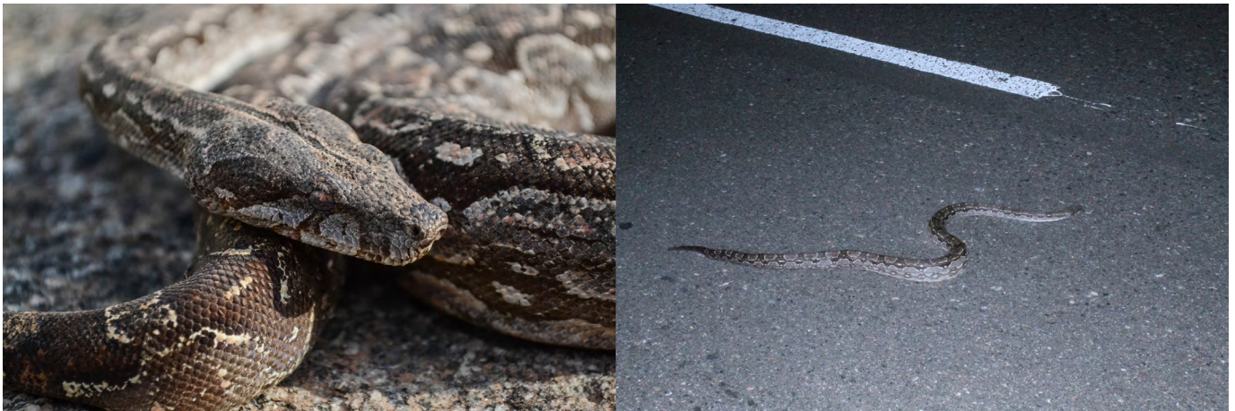
Figure 1. Boa constrictor occidentalis UNSJ 2098 on Provincial Route 510 in Valle Fértil department, San Juan province, Argentina.

Tucumán (Laurent and Terán 1981), and San Juan (Ávila et al. 1998; Acosta and Ávila 2001; Laspiur et al. 2010). Giraud and Scrocchi (2002) also included it in La Rioja, Santiago del Estero, Jujuy, and Catamarca. Recent studies have attempted to represent its distribution in Argentina based on observational records according to several environmental factors (Di Cola et al. 2008), and through surveys (Waller et al. 2010) (Figure 2).