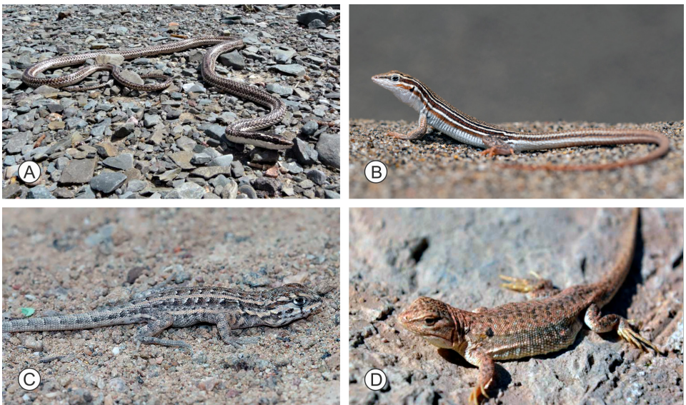
Fig. 3. Studied hosts. A = Philodryas trilineata , B = Aurivela longicauda, C = Liolaemus darwini, D = Liolaemus riojanus