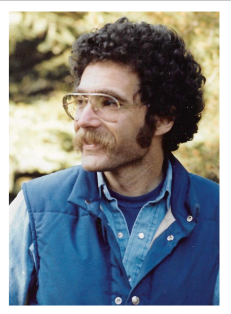
Fig. 1 Leonard Burton Radinsky (1937–1985), an American paleontologist born in Staten Island, NewYork.

recognized, which today converge on quantifying the variation in morphology of organisms and evaluating or explaining the proportion of such variation that can be attributed to the environment (adjustment to a functional task) and to history (ontogeny and phylogeny; see Vizcaíno et al. 2016). Later, Radinsky also suggested that "Ideally, form-function correlation and biomechanical design analysis approaches are used together to examine a given problem or question" (Radinsky