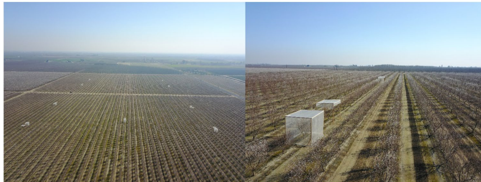
Figure 1. Aerial images of the experimental setup. Left image, almond fields with experimental trees. Right image, a closer look of the treatment “blocks”, consisting of a group of three neighboring trees, each one randomly assigned one the three different pollination treatments.

Under this scenario, the self-fertile almond variety named Independence ( Independence R (Alm-21 cv.) Patent no. 20295) was developed, becoming increasingly popular among Californian growers 16 . This was meant to be a massive breakthrough for almond industry, because this new variety was advertised as bee-independent due to self-fertility and its presumed high capacity for autonomous self-pollination 7,17,18 . Thus, cultivation of this variety would, in principle, benefit growers by removing the costs of renting bee colonies, among other advantages. In fact, the area cultivated with self-fertile Independence increased exponentially since its release in 2008 16 . However, despite claims of bee-independence, there is an information gap on the real pollinator dependence of this fast-growing almond variety.