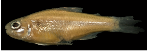
Figure 1 - Creagrutus affinis , MLP 11434, 29.0–31.2 mm SL, Caño Caracolí, Río San Jorge basin, Colombia.

the Creagrutus species that is composed of three rows of teeth on the premaxilla (a single lateral tricuspid tooth; primary tooth row with 6 medium-sized tricuspid teeth; posterior triad of larger tricuspid teeth).