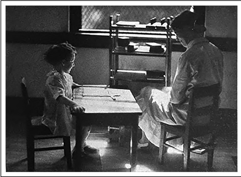
Figure 3. Intelligence testing at the Child Development Institute, ca. 1931. Intelligence testing was a key feature at Columbia's Institute. It was conceived as a means for advancing research on developmental norms and for providing practice for graduate students.

By 1931, less than 1% of American researchers in child development were working at the Institute (Hicks, 1931).