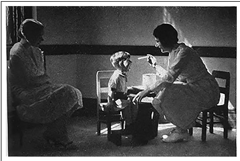
Figure 2. A typical physical examination at the Child Development Institute, ca. 1931. Children at the nursery schools underwent daily physical examinations in order to prevent contagion and to place them in suitable educational programmes. Source: Davis and Hansen (1933: 6–1). Image in public domain.