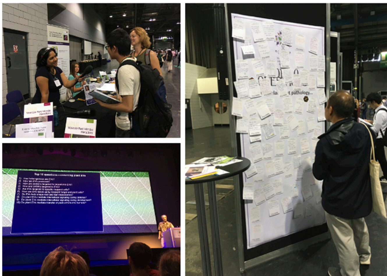
Fig. 1. Gathering unanswered research questions from the community at the IC-MPMI in Glasgow, U.K., July 2019.

Looking more broadly, the microbiome, comprising those microbes that live on, around, and within plants, manipulates plant physiology and defense, priming plants for future encounters with pathogens and insects, increasing their resilience (Pieterse et al. 2014). How do interactions within the