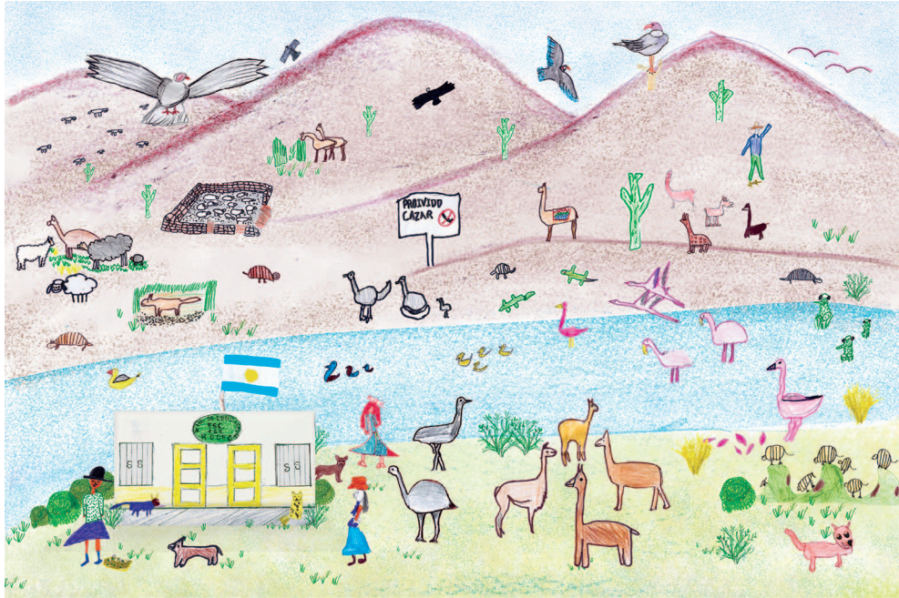
FIGURE 4 Biodiversity collage made by children of 3 schools from the Laguna de los Pozuelos MAB Biosphere Reserve in Jujuy, northwest Argentina.

when volcanoes are “on” ( prendidos in Spanish). Two other activities were proposed, drawing the landscape (Figure 3B) and writing poetry, with amazing results (the Spanish originals and further examples are provided in Appendix S1, Supplemental material , https://doi.org/10.1659/MRD-JOURNAL-D-20-00009.1.S1 ):