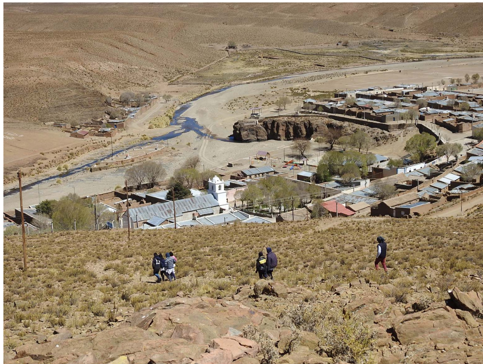
FIGURE 2 Santa Catalina school children coming back from the mountain to the town.

activity. We also proposed the creation of some form of lasting record, a material reminder of this shared experience, to which end participants were invited to engage in creative writing and drawing activities. All the exchanges and the children's productions were in Spanish.