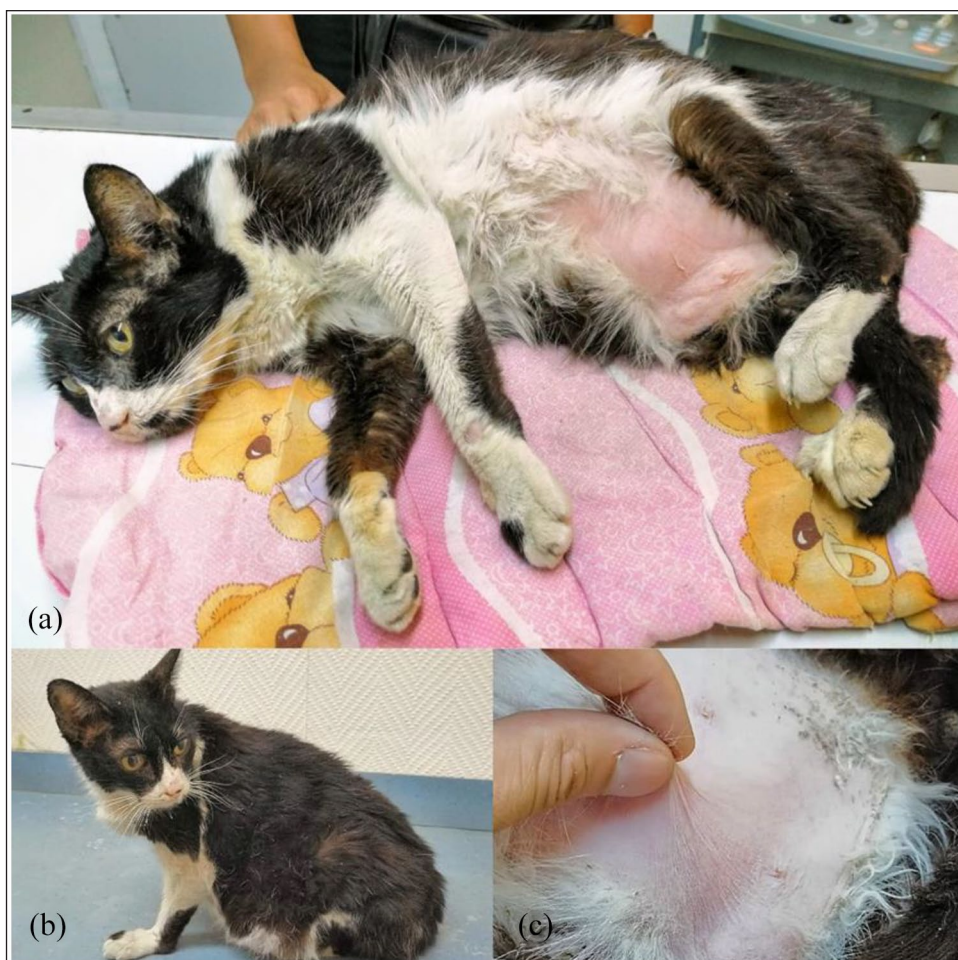
Figure 1 Clinical features of the cat before cabergoline treatment. (a,b) Lethargy, abdominal distension, alopecia and unkempt haircoat; (c) fragile, thin, dry and inelastic skin

adrenal longitudinal section: 1.81 \times 0.55 cm; left adrenal longitudinal section: 1.40 \times 0.65 cm) and hepatic steatosis were evidenced (Figure 2). Diabetes mellitus (DM) was diagnosed and dietary and medical treatment was started with a commercial diet for diabetic cats (Royal Canin Diabetic for cats) and insulin glargine (1 IU q12h SC [Lantus; Sanofi-Aventis]). The cat had not been previously treated with glucocorticoids or progestagens.