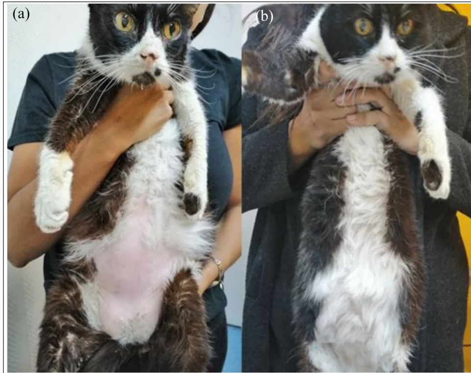
Figure 4 Clinical appearance of the cat, ventral view: (a) at diagnosis of hypoadrenocorticism and (b) at month 3 of cabergoline treatment. After treatment with cabergoline, the abdominal distension was reduced and the alopecic areas were covered with new hair

therapy, for a minimum of 28 days. 9 The cat in this report fulfilled these criteria. Feline diabetic remission was previously described in cats with HAC treated with trans-sphenoidal hypophysectomy, unilateral and bilateral adrenalectomy, pituitary irradiation and also with trilostane. 10–13 In diabetic cats (type 2DM), diabetic remission most often occurs within the first 6 months after the diagnosis of DM. 14 In our cat, diabetic remission was achieved rapidly: around 30 days after insulin therapy and, surprisingly, 3 days after cabergoline treatment with clinical signs of hypoglycemia. In cases of feline secondary DM, such as in this report, diabetic remission could be achieved once the underlying inducing disease is treated effectively. 13,14 However, it is important to highlight that treatment with cabergoline was only associated with diabetic remission and that it is possible that the diabetic remission occurred independent of the treatment with cabergoline.