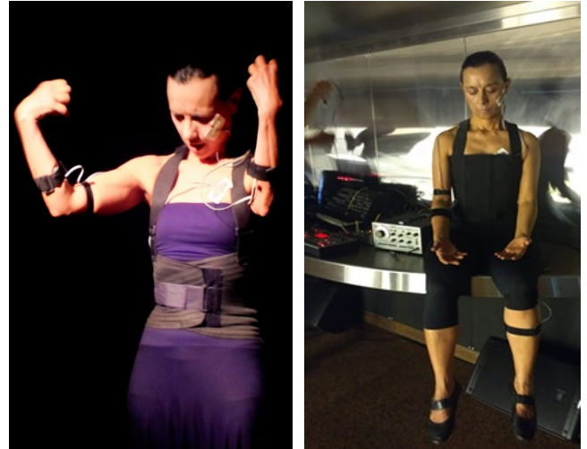
Figure 2. Photos of the artist in two different performances wearing WIMUMO.

Consequently, this use of biomedical signals for interactive performance dance expands the expressive universe to include people with motor disabilities allowing them new dimensions of creative and expressive output through a scenic and technological mediated activity which otherwise would be difficult if not impossible.