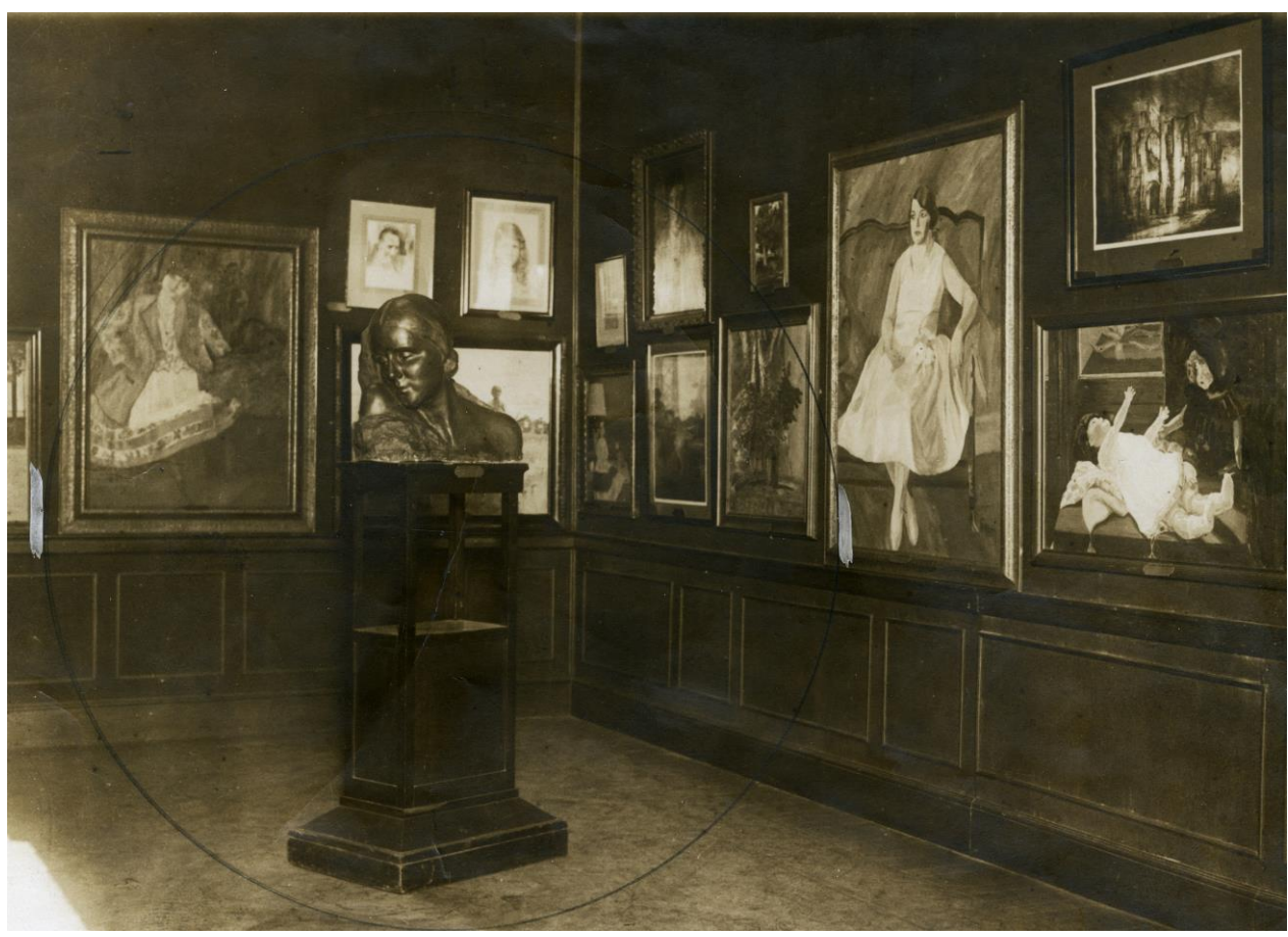
Figure 1. View of the Exposición de Artes e Industrias Femeninas at the Club Argentino de Mujeres, 1928.

According to Barrancos, the middle-class women who were the core of the Club revealed a willingness to share ideas and efforts to alter the traditional lives of women.<sup>24</sup> The Club offered all-female sociability in the growing city of Buenos Aires.