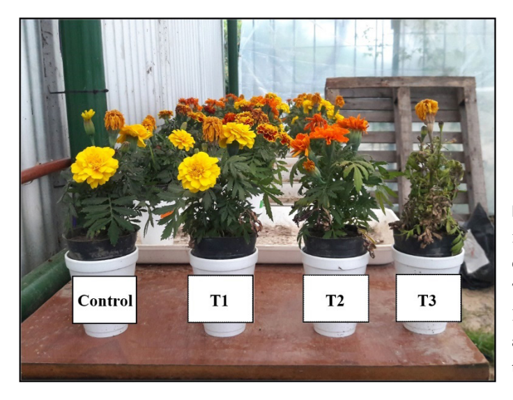
Fig. 1 Plants of Tagetes erecta L. irrigated with increasing doses of landfill leachate during 34 days

Values represent means (n = 9) \pm standard errors (SE). Within each column, means followed by different letters are significantly different (p \leq 0.05 ) according to a Tukey's test. FM: fresh matter.