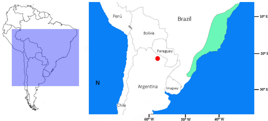
Figure 1. Geographic distribution of Trachycephalus mesophaeus , showing the new record in Las Lomitas (Formosa Province; red circle) and previous records (in green).

On the other hand, the finding of a typically Atlantic Forest species in the Chacoan region is not uncommon, even though, in the case of T. mesophaeus , the occurrence in the Chacoan region is more than 1300 km from the species' main geographic range in the Atlantic Forest. It is well known that many species are disjointly distributed in the Atlantic Forest and the Amazon Basin, with these biomes separated from one another by the broad diagonal of xeric habitats comprising the Chaco (Ab'Saber 1977). There is evidence supporting a past connection of the Atlantic Forest with the Amazon Basin through this dry vegetation diagonal during the latest