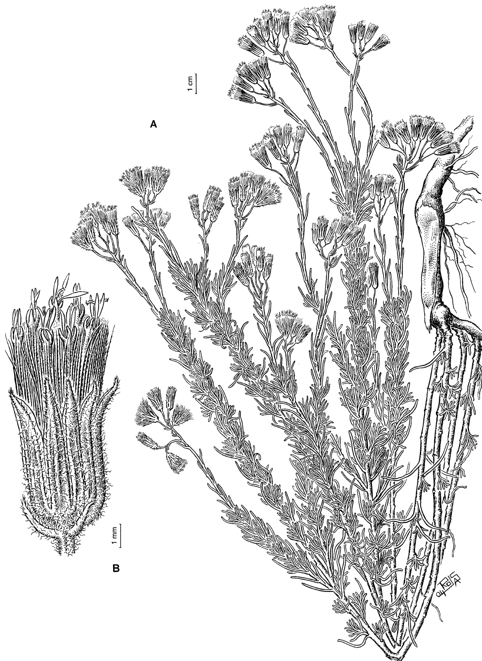
Figure 1. Senecio fragrantissimus Tortosa & A. Bartoli. —A. Habit. —B. Capitulum. Drawn from the type, G. Covas 1337 (LP).

Etymology. The specific epithet makes reference to the fragrance to which all collectors of this species alluded.