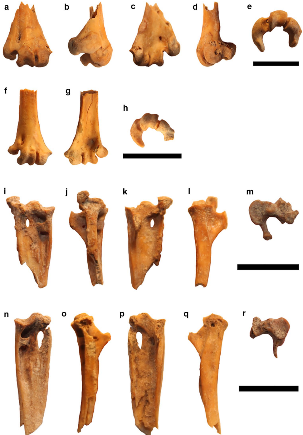
Fig. 2 Tyto aff. T. furcata (EPNV, no. 6365; a–e ) distal right tarsometatarsus in ( a ) cranial, ( b ) lateral, ( c ) caudal, ( d ) medial and ( e ) distal views. Athene cunicularia (EPNV, no. 6366; f–h ) distal right tarsometatarsus in ( f ) cranial, ( g ) caudal and ( h ) distal views. Glaucidium sp. proximal right (EPNV, no. 6363; i–m ) and proximal left (EPNV, no. 6364; n–r ) tarsometatarsus in ( i, n ) cranial, ( j, o ) lateral, ( k, p ) caudal, ( l, q ) medial and ( m, r ) proximal views. Scale bars 1 cm

Strigiformes Wagler, 1830 Tytonidae Ridgway, 1914 Tyto Billberg, 1828 Tyto aff. T. furcata