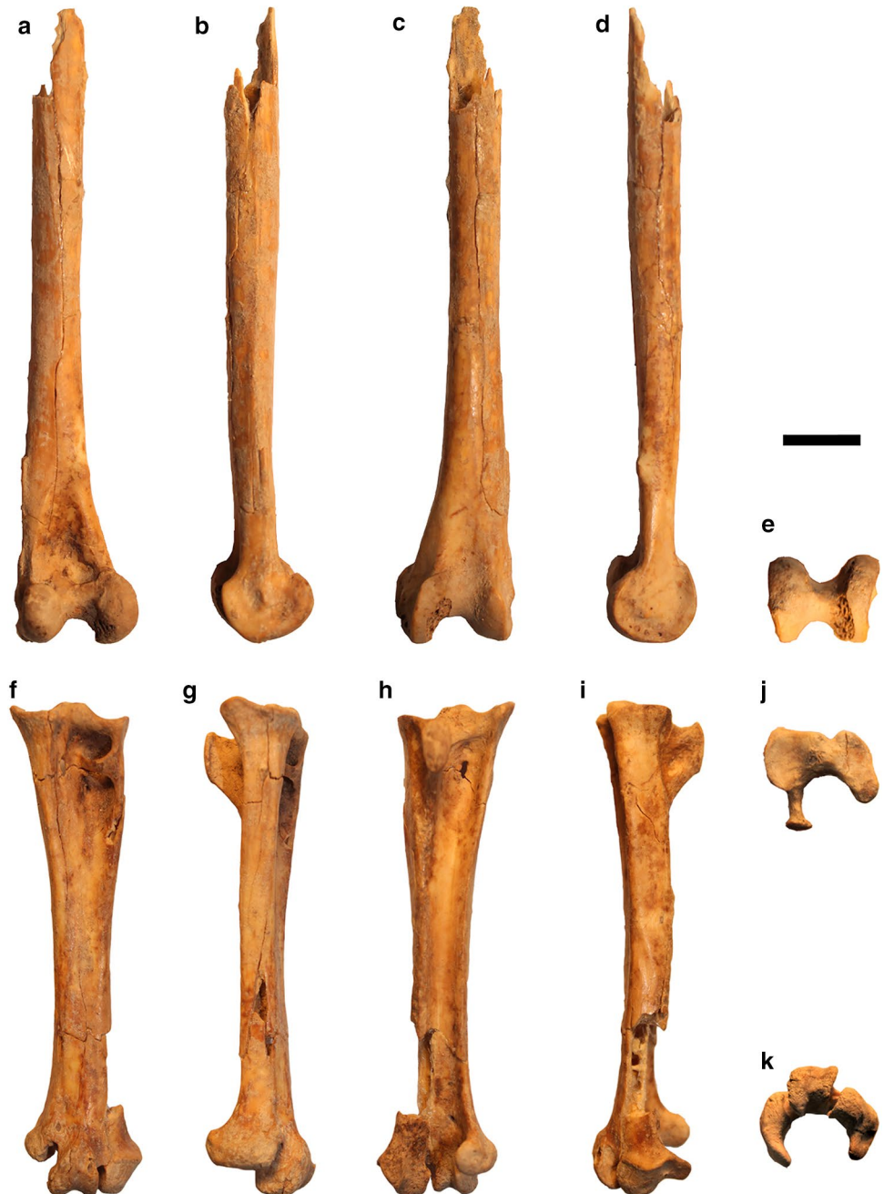
Fig. 3 Asio ecuadoriensis nov. sp. distal right tibiotarsus (EPNV, no. 6367; a–e) and right tarsometatarsus (EPNV, no. 6368; f–k) in (a, f) cranial, (b, g) lateral, (c, h) caudal, (d, i) medial and (j) proximal and (e, k) distal views. Scale bar 1 cm

by an asterisk): tarsometatarsus with robust shaft (similar to A. priscus ), well-developed and proximally extended crista lateralis hypotarsi*, proximal end of crista lateralis hypotarsi forming a well-developed subtriangular surface in lateral view (similar to A. flammeus ), strongly concave lateral margin of shaft (similar to A. flammeus ), crista plantaris medialis well developed and strongly convex (similar to A. priscus ), calcaneal ridge proximodistally low and transversally thick (similar to A. priscus ), proximally oriented calcaneal ridge (similar to A. flammeus ), strongly distally divergent middle trochlear rings* (subparallel in A. flammeus and A. priscus ), and tibiotarsus with proximal part of