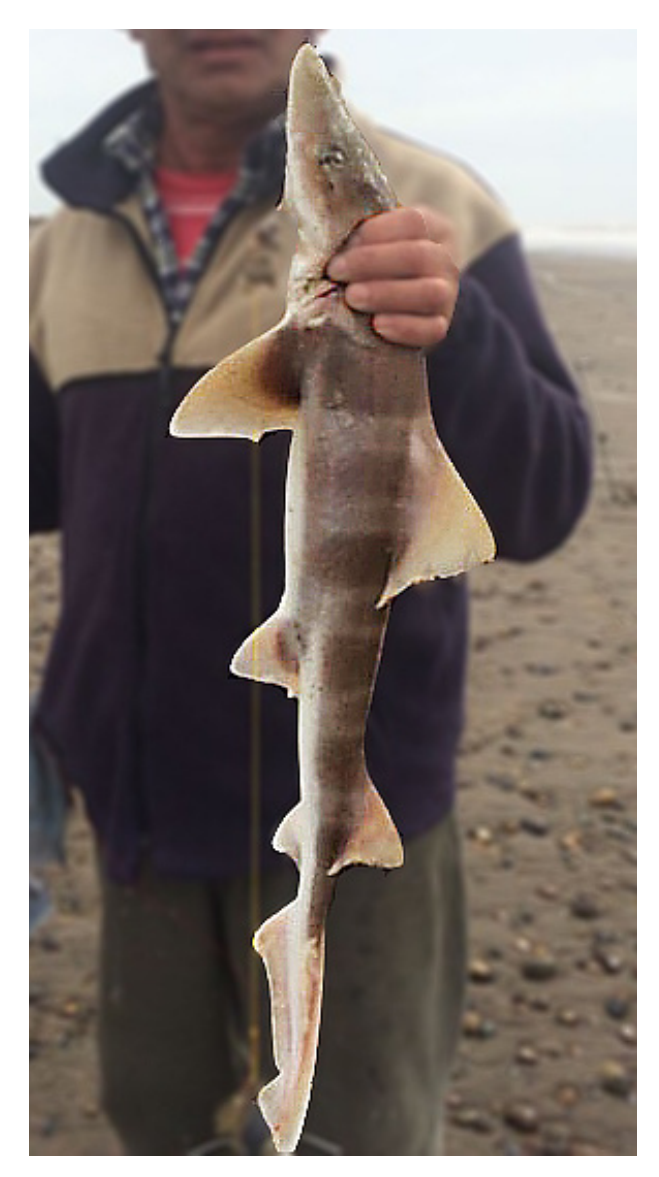
Figure 2. Specimen of Mustelus fasciatus from "El corvinero", it was captured using rand released alive by a local angler.

this absence in scientific surveys made during the 1990s (Massa 2012). This downward trend in the population in the AUCFZ has also been observed in Uruguay; during scientific surveys there, only 2 individuals were captured in fall of 2001 (1 female, TL = 157 cm, weigth = 25.2 kg, depth = 20 m; 1 unsexed individual, TL not recorded, weigth = 17.4 kg, depth = 22 m) (L. Paesh pers. comm.).