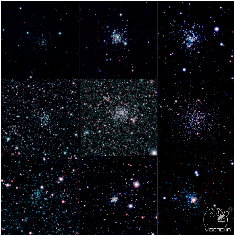
Figure 1. Mosaic of coloured images of the nine clusters analysed in Paper I (Maia et al. 2019) based on V,I images. Each image has a size of 3' \times 3' , North is up, East is left.