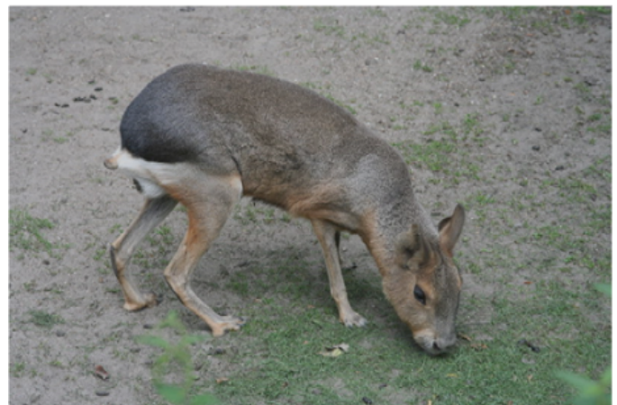
Figure 3 – Crouched body and plantigrade posture in short-limbed cuis Cavia apera (above) vs. upright body and digitigrade posture in the mara Dolichotis patagonum (below). Both species belong to the family Caviidae (Rodentia, Caviomorpha).