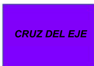
Figure 3: Chromatic risk for Cruz del Eje.

color (Figure 1). In our case, we represent in red the vulnerability of FNS, green for social vulnerability and blue the climatic one. Thus, the vulnerability intensity of these components can be represented by the intensity of the corresponding color, being 0 (low vulnerability), 125 (medium vulnerability) and 255 (high vulnerability).