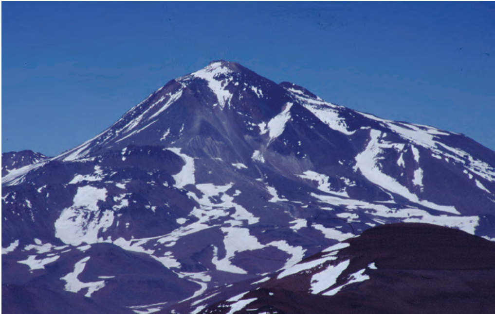
Figure 1 Volcano Lulllaillaco in northern Argentina (© Constanza Ceruti).

at an altitude of 22,110 ft. (6,739 meters above sea level), the mountain-top shrine of Lulllaillaco is considered to be the highest ceremonial site in the world (Reinhard and Ceruti 2010). Archaeological research conducted by Johan Reinhard and Constanza Ceruti at the Inca ceremonial complex of mount Lulllaillaco led to the discovery and excavation of three Inca frozen mummies and more than one hundred sumptuary offerings that were buried five hundred years ago. The expedition was co-directed by the author of this paper, who personally supervised the archaeological work undertaken on the summit. Team members included Peruvian and Argentinean archaeology students, as well as mountain climbers of both nationalities and indigenous members of the Quechua community. The project was officially authorized by the Direction of Cultural Heritage in Salta and the financial support to undertake the expedition to mount Lulllaillaco was provided by a grant from the National Geographic Society. Assistance for transportation to and from the mountain was provided by the National Army of Argentina, with the collaboration of the local communities of Tolar Grande and San Antonio de los Cobres.