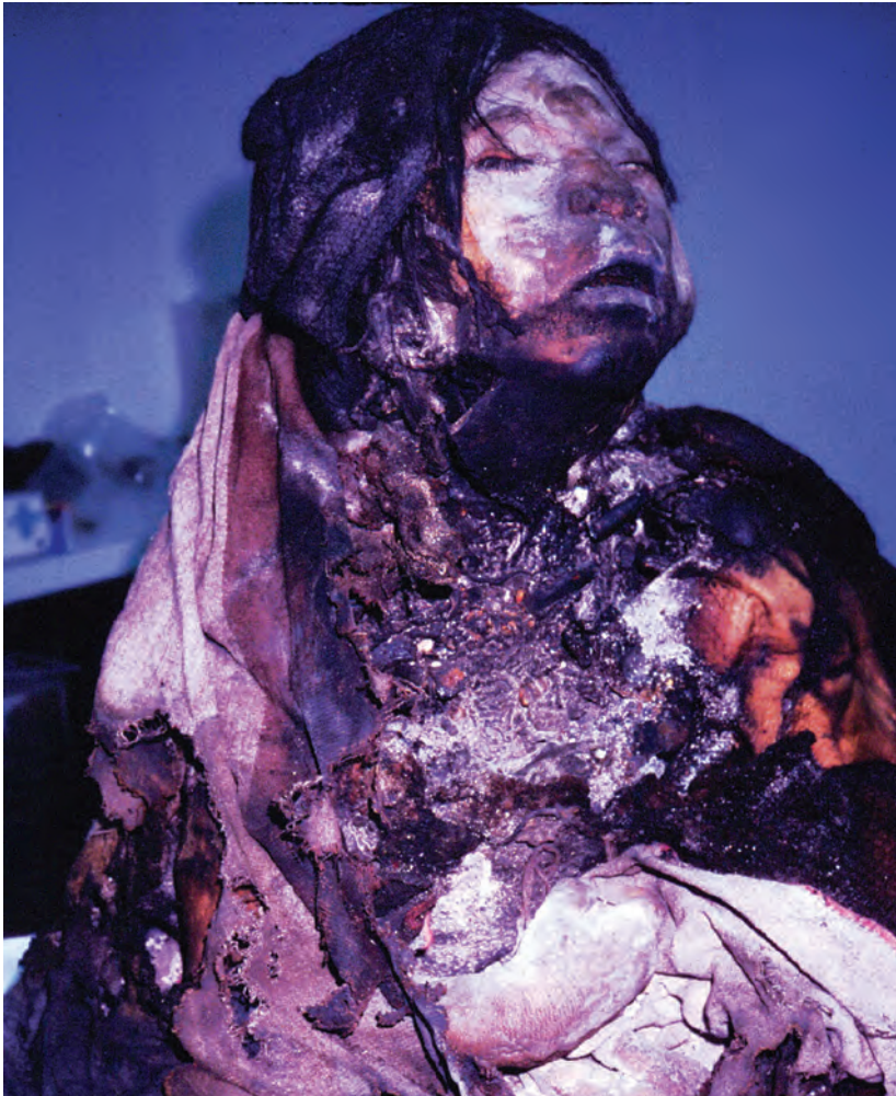
Figure 8 The mummy of the Lightning Girl

The upper lobe of the right lung of the older female shows a triangular hypodense zone corresponding to an abnormal air-trapping area, which led Carlos Previgliano to diagnose that the older female had suffered from obliterative bronchiolitis. The computerized 3D images reveal that there are hyperdense opacities in the aorta and vena cava of the maiden, which seem to correspond to clots with calcifications (Villa et. al. 2011). CT-scans and radiological analyses do not show signs of upper respiratory or pulmonary infections in the boy (Previgliano et. al. 2003a).