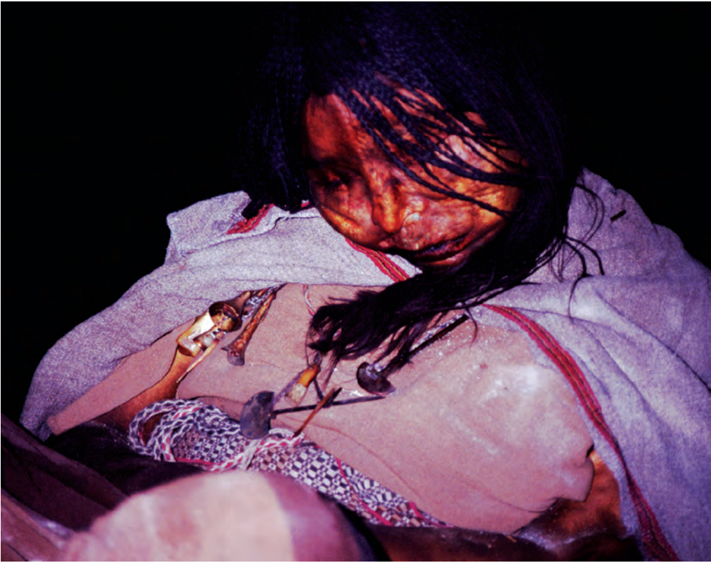
Figure 9 The Llullaillaco Maiden (© Constanza Ceruti).

The intestines of the mummies contain feces, proving that the children had eaten a solid meal a few hours prior to their death (Previgliano 2003b). The sagittal 3D view of the intestines of the younger girl shows a dilation of the sigmoid and rectum, which can be a sign of constipation or overfeeding (Villa et. al. 2011).