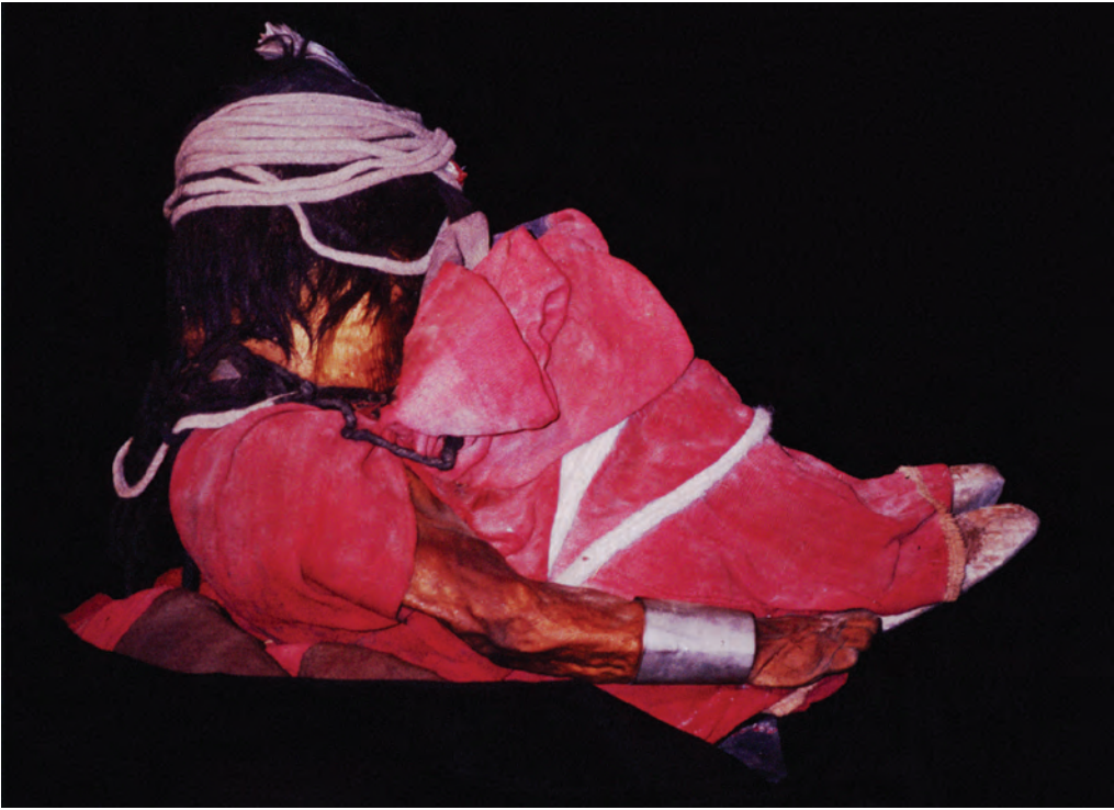
Figure 7 Inca mummy of the Lulluillaco boy.

The mummies of the boy and the younger girl show no evidences of pathological conditions associated with the crania and face, with the exception of bi-protrusion, as showed in the cephalometric analysis (Arias Araoz et. al. 2002). The dental X-rays show no evidences of cavities in any of the mummies. The two younger children show a pattern of severe wearing of the crowns of the teeth, which could not be observed in the older female (Arias et. al. 2002).