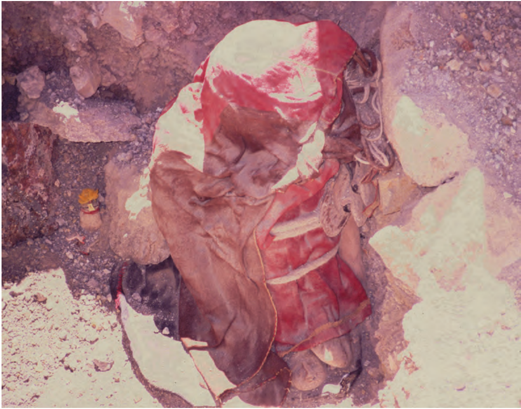
Figure 3 The funerary bundle of the Lullaillo boy in situ.

tion, with the legs over his body and wrapped around with ropes. This mummy was covered in a red outer mantle (Ceruti 2003a; Reinhard and Ceruti 2010).