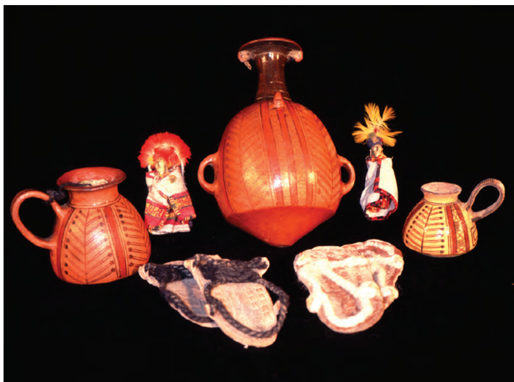
Figure 5 Inca offerings from Mount Lullaillo.

The strategy of preservation of the Lullaillo frozen mummies involved daily control of the conditions of temperature and humidity in the freezers, combined with limited working sessions in which several interdisciplinary studies were performed simultaneously. Working sessions with the mummies and other organic materials were undertaken as part of a plan of periodic controls that involve macroscopic exams, microbiological analysis, photography, and filming. The sessions with the frozen mummies were limited to a maximum duration of 20 minutes and were planned several months in advance. The participation of different specialists was coordinated in order to maximize the use of the time when the mummies were out of the freezers.