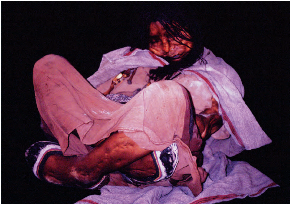
Figure 6 Frozen mummy of the Inca Maiden of Lulluillaco (© Constanza Ceruti).

While at Catholic University, examination of the mummies and materials always took place inside the laboratory. In the case of X-ray studies, a complete set of radiological equipment had to be installed in order to avoid any risk in the transportation of the mummies outside the laboratory. The studies that were undertaken were primarily noninvasive in order to maintain the integrity of the mummies' body tissues and interior organs. Microbiological tests performed proved negative, suggesting that microorganisms in the environment had not affected the mummies.