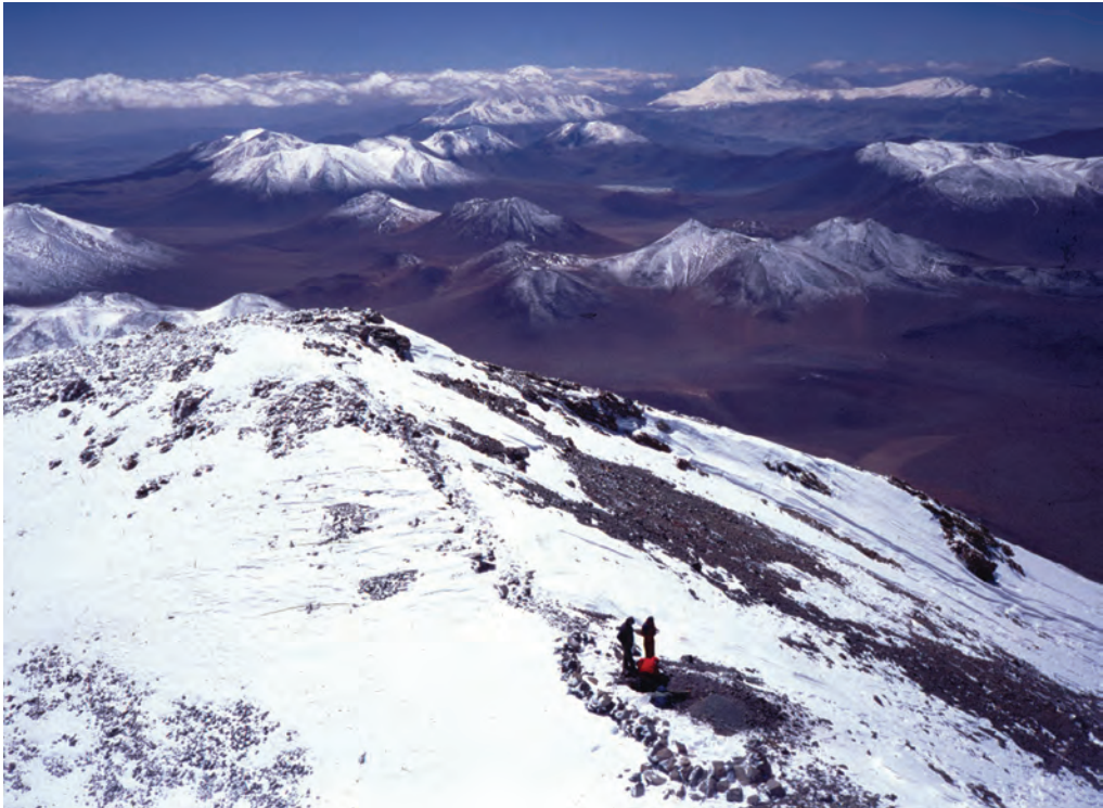
Figure 2 Inca shrine on the summit of mount Llullaillaco, the highest ceremonial site in the world.

This article will provide an overview on the paleopathology of the frozen bodies from mount Llullaillaco, among the best preserved Ice mummies known to date. The Llullaillaco mummies have been previously analyzed in the context of the diversity of mummies worldwide (Ceruti 2010); as objects of dedication (Ceruti 2004), and in connection to the religious role of children in the Andes (Ceruti 2008, 2010). This study focuses on the frozen mummies of Llullaillaco as objects of bioarchaeological and medical research.