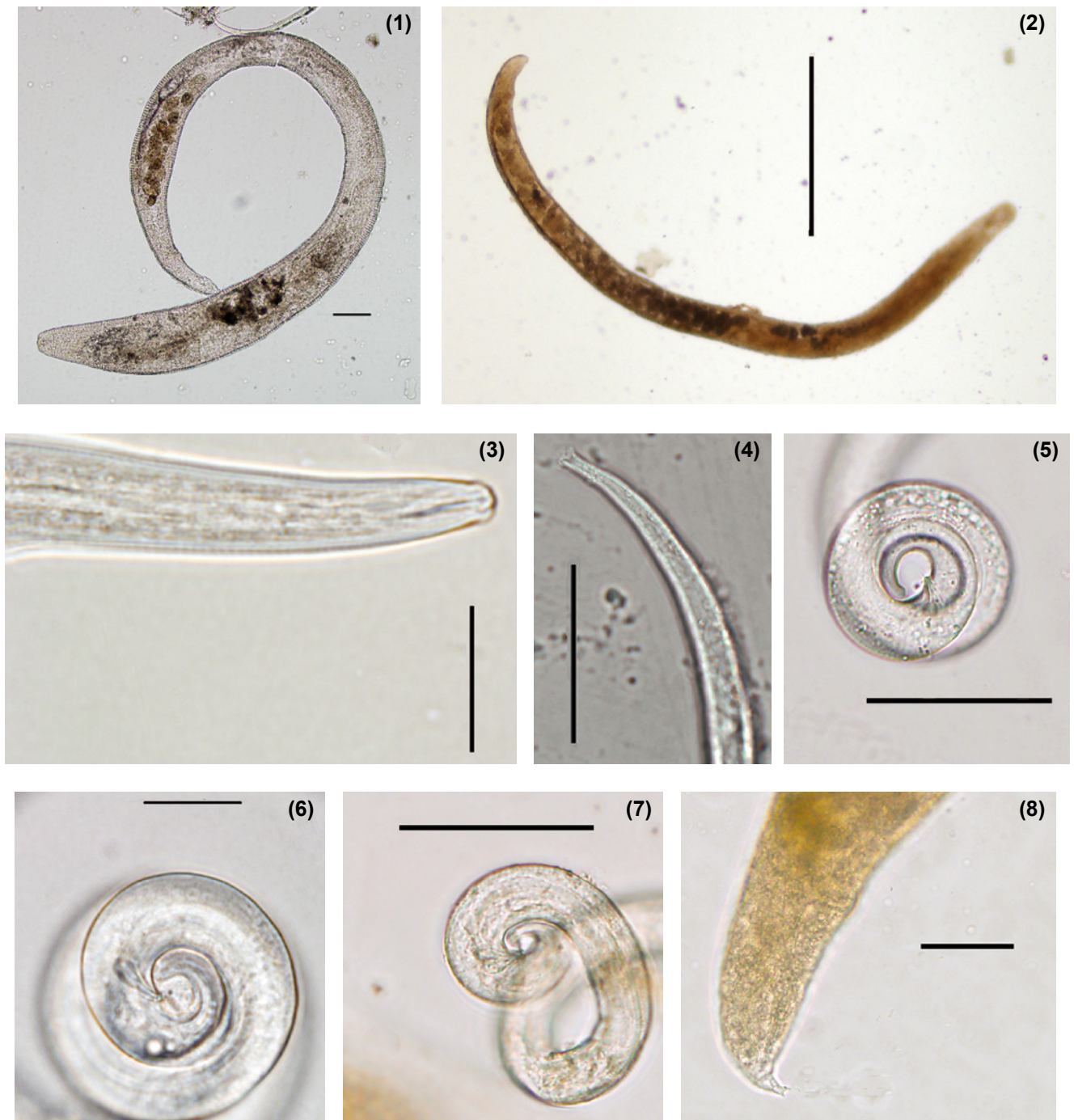
Figure 1–8. Parasitylenchus pseudobifurcatus sp.n. (1) First generation entomoparasitic female. (2) Second generation parasitic female. (3) Anterior end of vermiform infective female. (4) Posterior end of vermiform infective female, showing tail bifurcated. (5) Posterior end of male showing the spicules triangular shaped and gubernaculum laminar. (6) Posterior end of male showing the spicules in bowling bottle shape. (7) Posterior end of male showing the spicules and gubernaculum long and wide. (8) Posterior end of female showing the tail bifurcated. Bars = (1) 100 µm; (2) 500 µm; (3, 6) 20 µm; (4, 5, 7, 8) 50 µm.

Males (Figs. 5, 6, 7): pharyngeal glands atrophied; tail tip angular-truncate, showing bifurcation in juveniles; spicules straight, in bowling bottle shape or triangular, with wide base. The gubernaculum long can assume several shapes, laminate and in bowling bottle shape. Usually it is straight, however it may be bent upward, or rarely appear double. Unfortunately the small size of this structure hinders further analysis. The bursa is absent