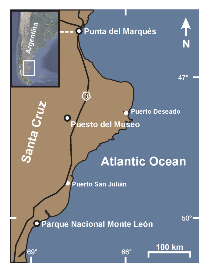
Figure 1. Map of study area and localities mentioned in the text: Punta del Marqués, Puesto del Museo and Parque Nacional Monte León.

Measurements were taken with a micrometer eyepiece under a Zeiss stereomicroscope. Colonies were coated with gold/palladium and images were obtained using a SEM