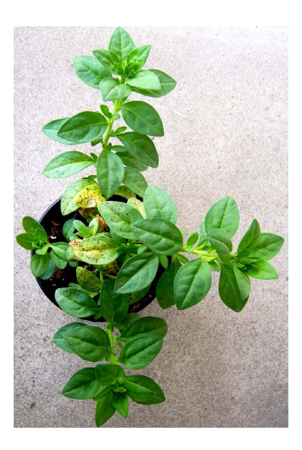
Figure 2. Spots caused by Nigrospora oryzae on basal leaves of Calibrachoa hybrida INTA 06575.

The fungal colonies developed from the leaves were subcultured onto fresh PDA at 25 °C to obtain a pure isolate, and study its characteristics. To enhance sporulation, 5 mm diameter plugs from the margin of an actively growing culture were transferred to the centre of Petri dishes containing synthetic nutrient-poor agar medium (SNA) and incubated at 28 °C (Wang et al., 2017). Additionally, in order to better clarify the identity of the pathogen, a molecular characterization of the purified isolate was performed amplifying and sequencing part of the ITS rDNA region using primers ITS1 and ITS4 (Wang et al., 2017). The sequence obtained in this study was submitted to GenBank (accession number MT177215) and the nucleotide BLAST comparison with published sequences at NCBI (http://www.ncbi.nlm.nih.gov/).