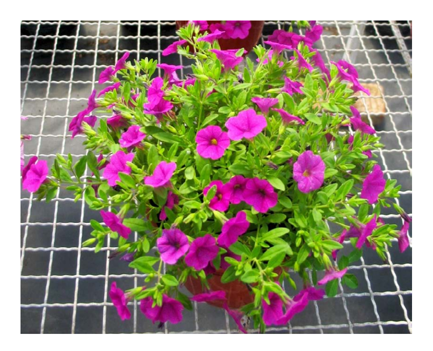
Figure 1. Healthy potted plant of Calibrachoa hybrida INTA 06575 on a greenhouse bench.

In October 2019, plants of calibrachoa INTA 06575 (Figure 1) grown in a polyethylene greenhouse in Hurlingham (Buenos Aires) developed a leaf spot disease.