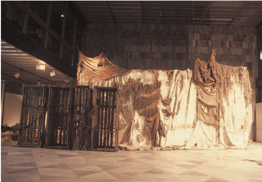
FIGURE 3. Romero, Sal-si-puedes . Installation view.