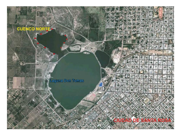
Figure 2. Location of the North basin and sampling sites (red) in Laguna Don Tomas (near the city of Santa Rosa) in the province of La Pampa, Argentina.

Figure 1. Geographical location of Lake Don Thomas in the province of La Pampa, central Argentina.