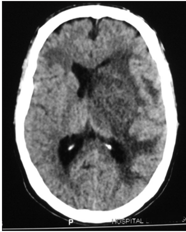
Figure 3: Computerized tomographic studies of the brain showing evidence of a focal lesion

following days the clinical condition improved. He was discharged from the hospital after 30 days in a good clinical and neurological condition.