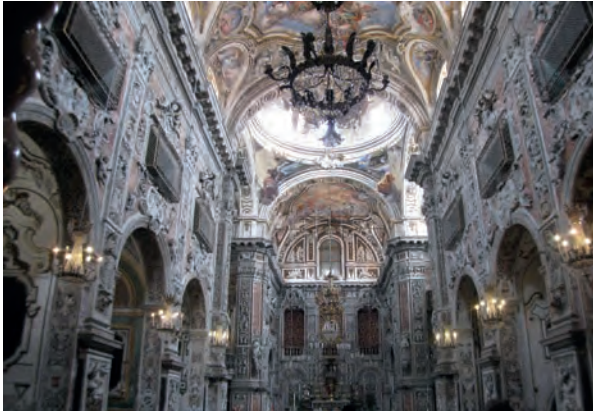
1. Church of Santa Caterina, Palermo.

Yet “baroque as Counter-Reformation” already too hastily elides baroque and Counter-Reformation. Certainly, this has been the dominant model within European scholarship on European baroque. But it is a perennial cliché, endlessly reiterated but rarely critically examined. In the great churches of Pallavicino in Bologna the cry of the Counter-Reformation resounds. But this is far from the situation in Naples or Sicily where the greatest adventures of the baroque take place (figs. 1-2). Baroque is far more than a first response to the spiritual crisis of the Reformation. Hostilities to Muslims, Moriscos and Jews arguably have as much purchase as anti-Protestantism.