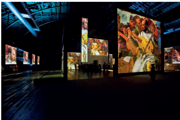
5. Peter Greenaway, installation view of Leonardo’s Last Supper: A Vision by Peter Greenaway , exhibited December 3, 2010-January 6, 2011 at the Park Avenue Armory, New York.