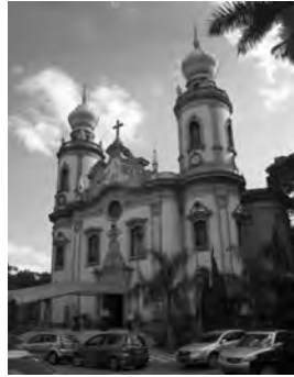
9. Church of Nossa Senhora do Brasil, São Paulo, façade and interior.

Jens Baumgarten. In my own research I analyze the architecture, decoration, and other visual material of the church Nossa Senhora do Brasil, one of the best known and most impressive churches in São Paulo, which can be classified as neo-baroque (fig. 9). The church combines different elements that reflect a political, religious and aesthetic project of Brazilian culture and history. It also shows the configurations