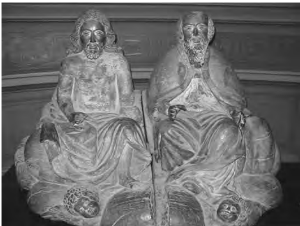
7. Anonymous, Holy Trinity , eighteenth century, Guaraní Jesuit Mission of the Holy Trinity, Paraguay.