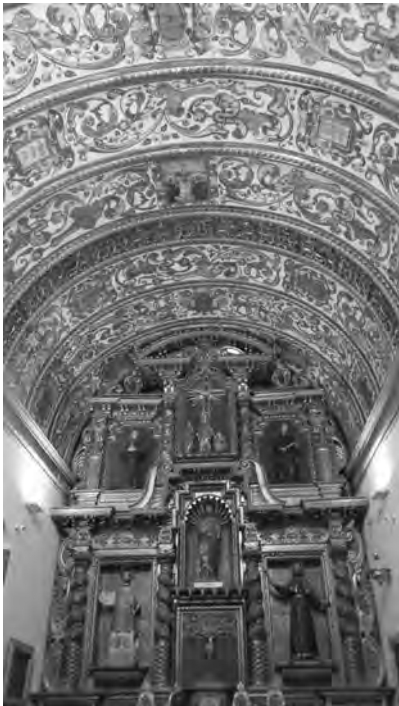
6. Capilla doméstica, Iglesia de la Compañía de Jesús, Córdoba, Argentina.

For example, new approaches like Eduardo Viveiros de Castro's notion of perspectival anthropology and controlled equivocation, or the post-comparative notion of "false friends," 27 can help in analyzing the complexity of the global baroque and in understanding how different visual systems and processes of conflict and negotiation were established in contexts of cultural alterity. This approach can facilitate the reevaluation not only of the relations between Christian colonizers and the indigenous communities, but also between the contemporary scholar and her objects of research, and offers alternative concepts to the dichotomy of center and periphery.