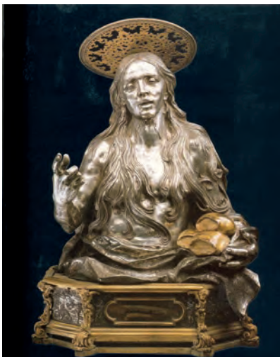
2. Lorenzo Vaccaro (attrib.), St. Mary of Egypt, silver reliquary, Naples, Chapel of the Treasury of San Gennaro.

How might the potential that baroque offers in relation to history – including history of art, music, literature – and conceptions of the past be best seized? In what ways might baroque decenter familiar narratives of the “long seventeenth century”? Part of baroque’s greatest potential is in terms of historical time. History is too readily mobilized for political ends. Resisting periodization assists in thwarting simple historicism. Instead of subjecting time to chronology, Walter Benjamin’s allegorical way of seeing grasps the constellation which one era has formed with an earlier one, opening a possibility of resistance to the catastrophe of modernity. Deleuze’s theory of the baroque fold, in contrast, investigates the baroque as a creative