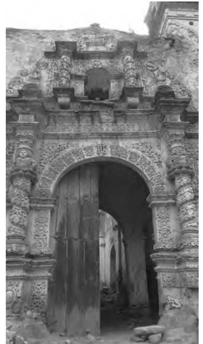
10. Façade of the church in Salinas de Yocalla (Bolivia), eighteenth century.

Recent debates within the writing of world art history have broken with references to the Brazilian reflection of Europe, the national paradigm; they seem to prefer an approach that follows a rather ethnically determined paradigm. Levy found a third way that could serve as stimulant or a meta-theoretical impulse for further developments of an art history of the baroque and the neobaroque.