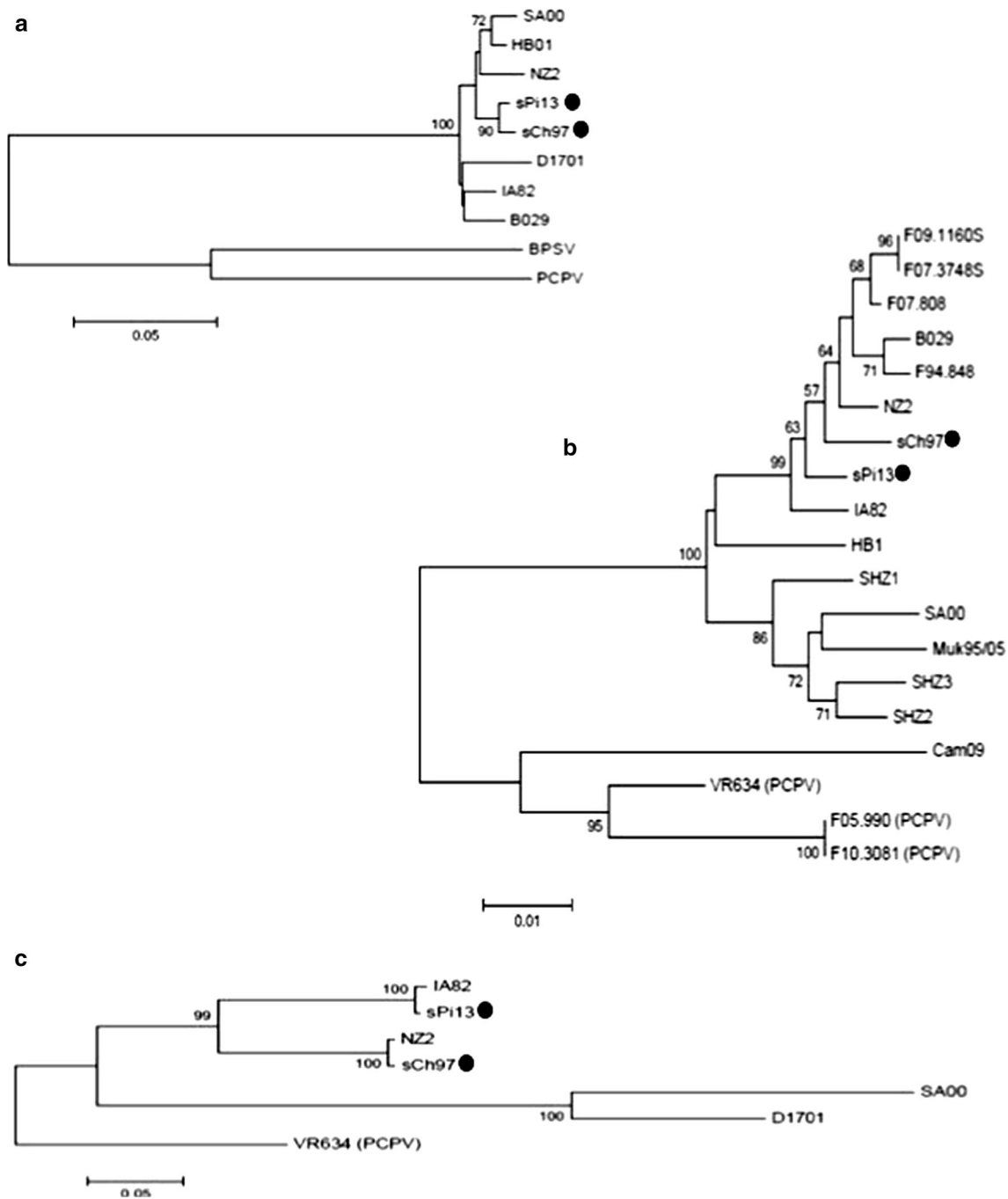
Fig. 2 Phylogenetic analyses based on the nucleotide sequences of ORF117, ORF127, and ORF109. Argentinian isolates are pointed with black circles. The phylogenetic relationship was constructed by the Neighbor-Joining algorithm using MEGA 6.0 software. Numbers

at node represent % of one thousand bootstrap replicates; only those nodes with values over 55 % are shown. The scale bars are expressed in relative nucleotide sequence difference. a NJ tree based on ORF127. b NJ tree based on ORF117. c NJ tree based on ORF109