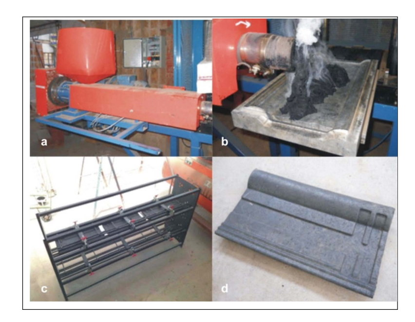
Figure 1. Manufacturing process of a recycled tile. (a) General view of the extrusion machine; (b) hot mix in the mold; (c) drying rack; (d) finished sample

the paste. Molding is performed for five minutes, during which the paste is hardened, thus maintaining the desired shape. The recently molded tile is put onto a rack, so that it will not deform while cooling. Then, the leftover material is trimmed off.