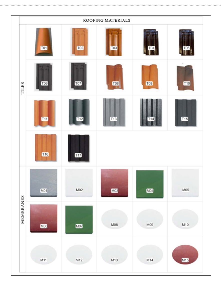
Figure 2. Images of evaluated roofing materials. Traditional clay and cementitious tiles (T01 to T16) and tiles with recycled composite (T17); aluminum and geotextile asphalt membranes (M01 to M07) and liquid membranes (M08 to M15)