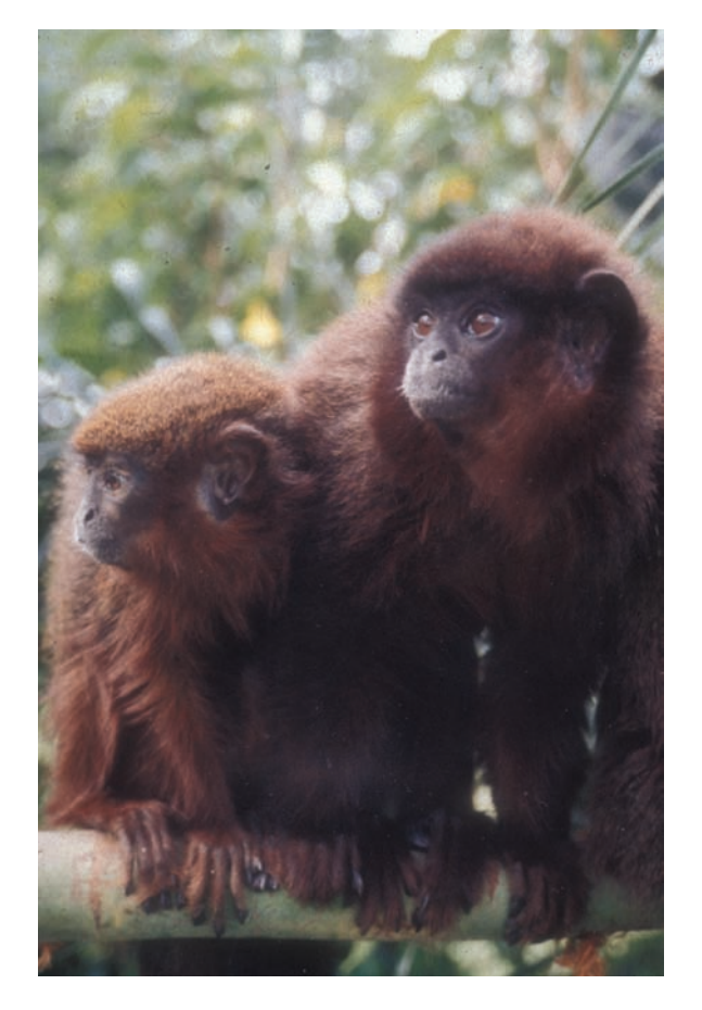
Figure 2 A titi monkey infant ( Callicebus moloch ) sits in physical contact with his father.