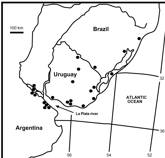
Fig. 1. Map of a portion of the La Plata river basin where the sigmodontine genus Deltamys is distributed. Black circles indicate recorded populations of Deltamys taken from GONZÁLES and PARDIÑAS (2002).

A single species, Deltamys kempfi Thomas, 1917 has been described, although two subspecies are currently recognised (GONZÁLEZ and MASSOIA 1995). Deltamys occupies wet environments in a small area of the La Plata river basin (Fig. 1). Its distribution ranges from northern Buenos Aires and southern Entre Ríos provinces in Argentina (MASSOIA 1964, 1983), throughout Uruguay, and extends by the Atlantic littoral of the Brazilian State of Rio Grande do Sul (GONZÁLEZ and MASSOIA 1995). The Argentinean populations correspond to the nominant subspecies, while the Uruguayan form is D. k. langguthi . Brazilian records have been ten-