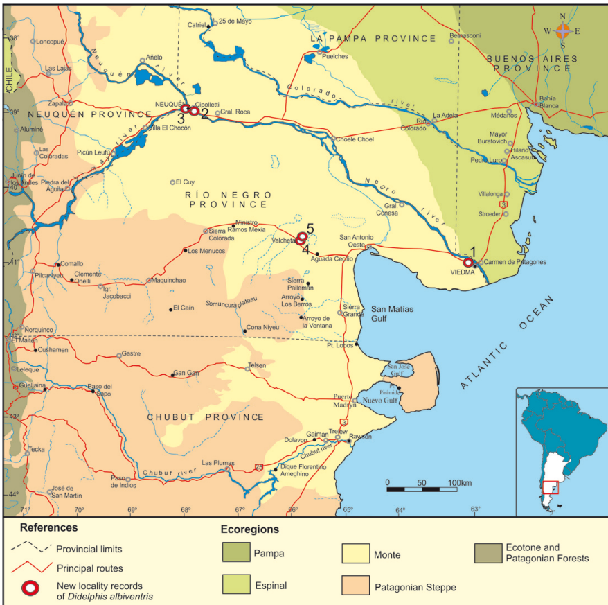
Figure - 2. Map of north-central Patagonia and adjacent areas with ecoregions (sensu Cabrera, 1976) showing the new localities for Didelphis albiventris reported in this contribution. 1, 6.5 km W of Viedma; 2, Cipolletti; 3, Neuquén city (this contribution, but see also Massoia et al., 2000); 4, 2 km N of Valcheta; 5, 8 km N of Valcheta.