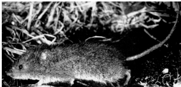
FIG. 1. A young Deltamys kemp from Laguna Negra, Rocha Department, Uruguay.

DIAGNOSIS. Deltamys kemp (Fig. 1) is barely distinguishable externally from medium-sized species of Akodon . General color of upper parts is darker than in most Akodon species. Epidermal scales of tail are more conspicuous than in Akodon . Skull (Fig. 2) is narrow and more gracile than in Akodon (Thomas 1917), particularly rostrum, anterior region of frontal bones, and zygomatic arches (Gyldenstolpe 1932). A karyological distinction is the absence of the small pair of metacentric chromosomes present in all Akodon (Gentile de Fronza et al. 1979, 1981).