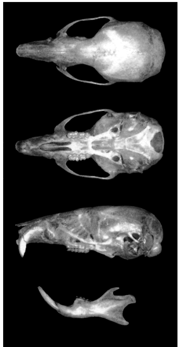
FIG. 2. Dorsal, ventral, and lateral views of skull and labial view of mandible of Deltamys kemp from La Balandra, Berisso, Buenos Aires Province, Argentina (Instituto de Limnología "R. Ringuelet" Mammal Collection number 256, adult female). Greatest length of skull is 25 mm. Greatest length of mandible is 16 mm.

GENERAL CHARACTERS. Deltamys kemp is a small sigmodontine, slightly larger than Mus domesticus , with a rotund body, relatively large head, and moderately short limbs and tail (Bianchini and Delupi 1994; Massoia 1964). Eyes are small, ears are narrow, and pelage is soft. Dorsum is a sparkling blackish brown in color, and venter is dull brownish gray. Sides are paler than dorsum but without a separation line. Fur is dense and velvety.