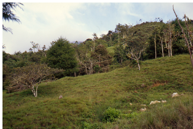
Figure 2. Habitat (type locality) of tadpoles of Hypsiboas aguilari on 12 February 2003.

Captive tadpoles of both H. aguilari and H. melanopleura were predominantly benthic. When grazing, the tadpoles of both species frequently emerged from the water with the anterior three quarters of their bodies on oblique or vertical surfaces.