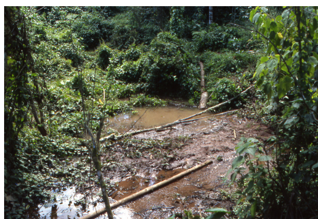
Figure 3. Habitat of tadpoles of Hypsiboas melanopleura on 17 July 2004. Water turbidity as seen in the background was the result of catching activities.