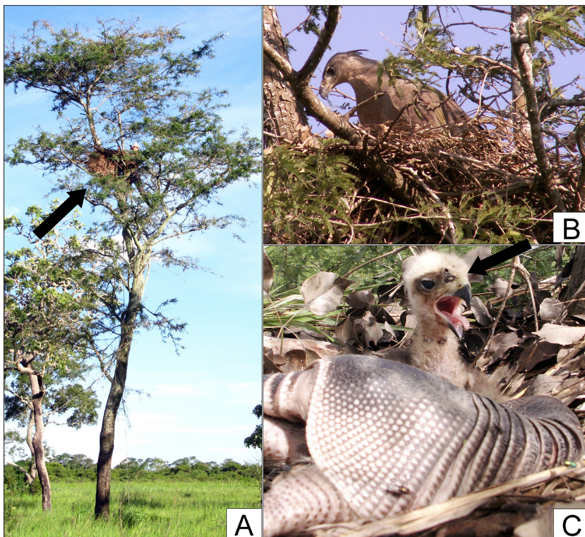
FIGURE 2. Nest tree (A), adult female at nest (B) and nestling (C) of Crowned Eagle. Note botfly on nestling's head

G. between the entrance of Estancia Cutal and the road San Pedro – Trinidad. Vidoz reported an individual 5.6 km south from this place in 29 July 2005 (Maillard et al. 2008). In September 2010, L. G. observed an adult and a juvenile perched near the main road.