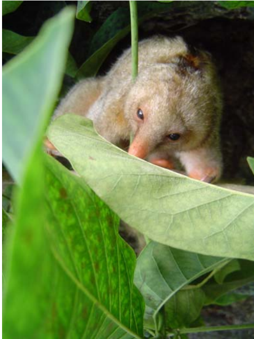
Fig. 1. Male silky anteater ( Cyclopes didactylus) from Recife, Pernambuco, Brazil.