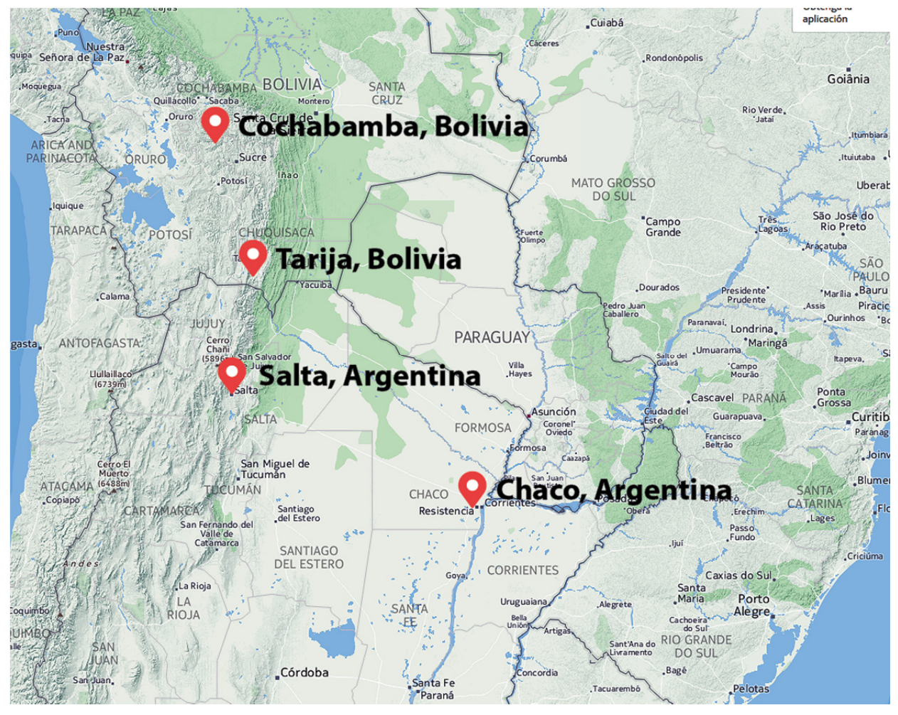
Figure 2. Geographic location of deltamethrin-resistant T. infestans in Argentina and Bolivia

The toxicological and biochemical studies on insecticide resistant in field populations of Argentina and Bolivia, demonstrated different mechanisms (Santo-Orihuela, Vassena, Zerba, & Picollo, 2008; Toloza et al., 2008). These studies identified at least three resistant profiles named Ti-R1, Ti-R2 and Ti-R3, for the Argentinean Acambuco, and the Bolivian populations Entre Ríos and Mataral respectively (Roca-Acevedo, Picollo, Capriotti, Sierra, & Santo-Orihuela, 2015; Gonzalo Roca-Acevedo, Picollo, & Santo-Orihuela, 2013) (Figure 3).