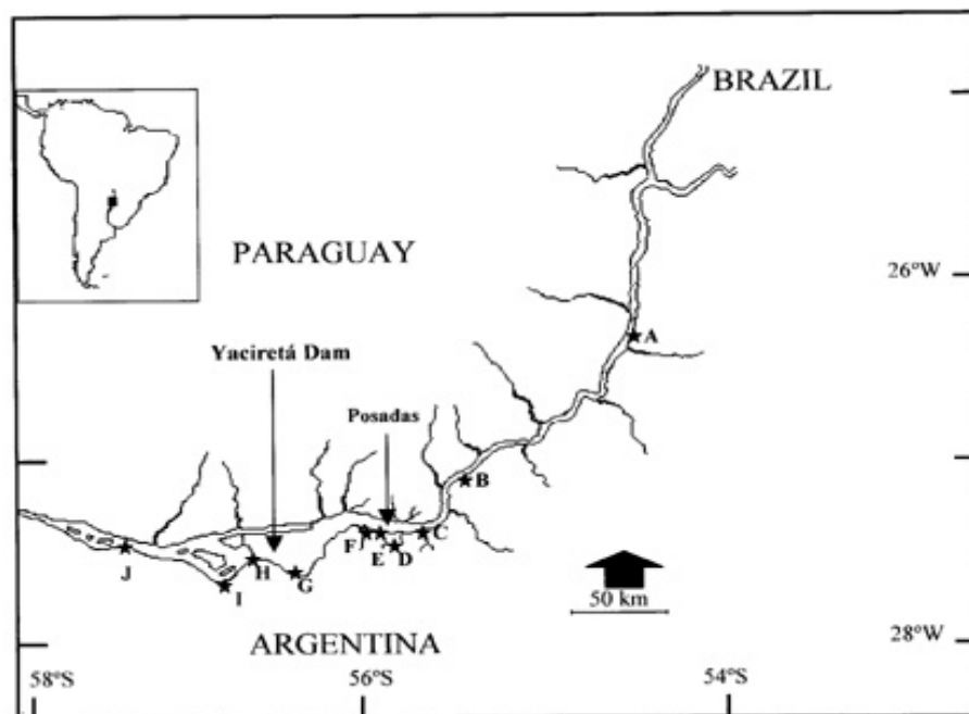
Fig.1: capture sites by CDC miniature light trap in the province of Misiones (A-F) and Corrientes (H-J), Argentina, 1993-1998. A: Montecarlo; B: Corpus; C: Candelaria; D: Zaiman; E: Mártires; F: Itaembé; G: Santa Tecla; H: Ituzaingó; I: Villa Olivari; J: Ita-Ibaté