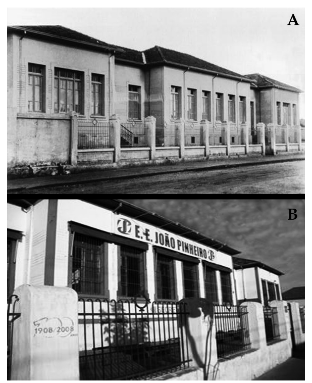
Figura 4. Jõao Pinheiro School, Ituiutaba District. A: School in 1920, B: The School today.