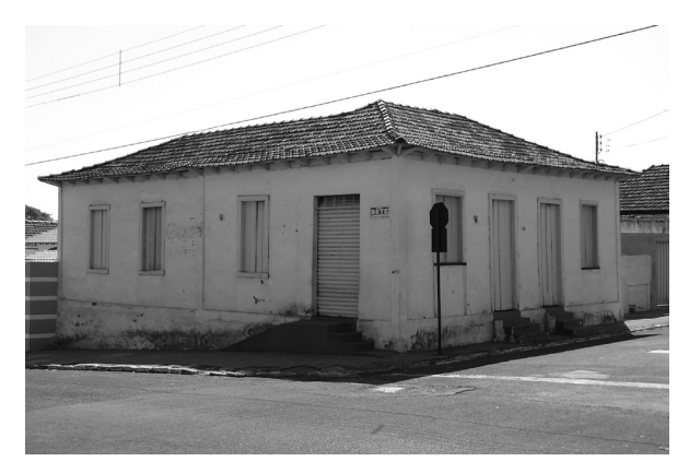
Figura 5. do Capitão Shoe Store, Ituiutaba District.