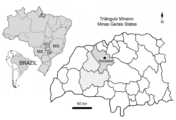
Figure 1. Ituiutaba District location, Triângulo Mineiro region, Brazil. MS: Mato Grosso GO: Goiás, MG: Minas Gerais, SP: São Paulo.

As mention before, ID has its local institutions and policies to preserve its CH and its pre-