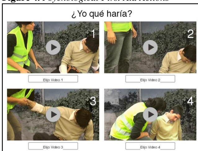
Figure 4. Psychological First Aid Actions

If the selected video was correct, by following the course of action of the PFA protocol, the system recorded the right option and it did the same if the option was incorrect. Later, they were presented the emotional or rational decision-making induction again before the screen showed a new set of four videos. Participants then would choose actions that were described in the other sets of videos to complete the experimental task. Likewise, the system recorded the decision making time of each performance and timed them since the appearance of the first video until participants clicked the chosen option.