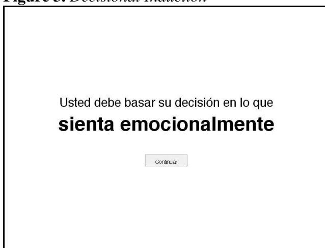
Figure 3. Decisional Induction

With these first indications, the first set of four videos was presented on the screen; video screen shows four possible PFA actions. Each of them has their own reproduction buttons with the question "What do I do?" and each participant had to play each video to watch the scenes and they could play it again at random according to their subjective needs. Finally they had to select the chosen action by clicking on the button under the desired video (Figure 4).