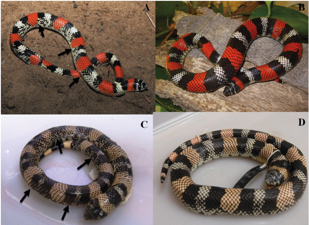
Figure 1. Comparison of Xenodon mattogrossensis and X. pulcher . Arrows point to white spots in the lateral side of black rings in X. mattogrossensis that are absent in X. pulcher . a) X. mattogrossensis , Fazenda Nhumirim, Corumbá, Mato Grosso do Sul (Photo by Marcio Martins); b) X. pulcher , Fazenda Patolá, Porto Murtinho, Mato Grosso do Sul (Photo by Franco Leandro de Souza); c) specimen of X. mattogrossensis (ZUFMS-REP 1516); d) specimen of X. pulcher (ZUFMS-REP 1003-CH290).

is high variation in our data and considerable overlap between the meristic characters of X. pulcher and X. mattogrossensis ; however X. mattogrossensis differs from X. pulcher and X. semicinctus in the presence of lateral white spots on the black rings (Scrocchi and Cruz, 1993), and the specimens from Porto Murtinho do not