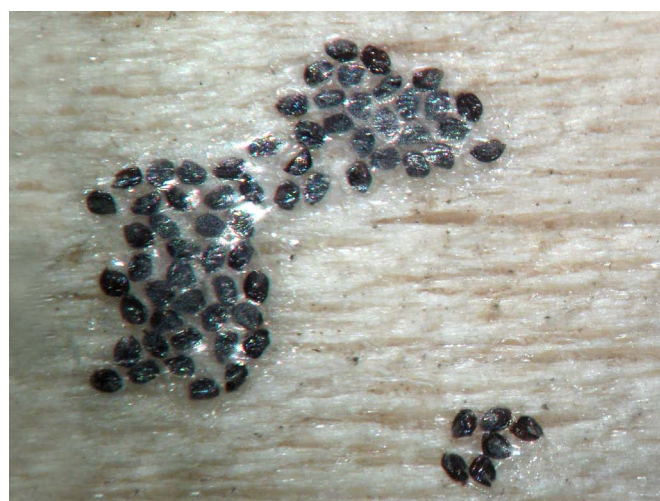
FIGURE 3. Egg mass of Dasyhelea necrophila .

The number of eggs groups per paddle varied as follows: 30.8% of paddles had only one egg group; 23.2 % of paddles had 2 groups; 19.3 % had 3 groups; 7.7 % had 6 groups and 3.8 % had 5, 9, 10, 11 or 22 groups. The eggs were deposited at 5.4 cm minimum average high (1-12.4) and 6 cm maximum average high (1-12.4) from the lower tip. Height of oviposition above the waterline was not recorded, but the records allow us to suppose that the water level was very variable in the ovitraps in the different trap localities. These observations allow us to broaden awareness of the egg masses of D. necrophila in nature and geographical distribution of this species.