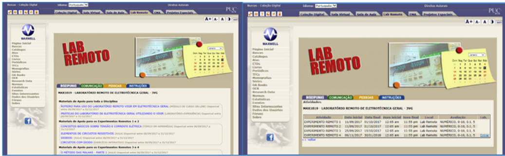
Fig. 1. Organization of the courseware (items are separated according to the topics they address) and access to experiments in the Lab Remoto learning space.