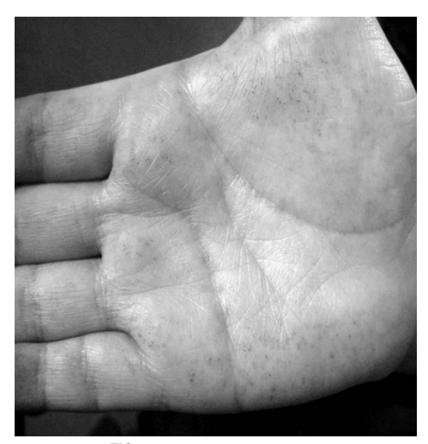
FIG. 1. Telangiectasias on palms.