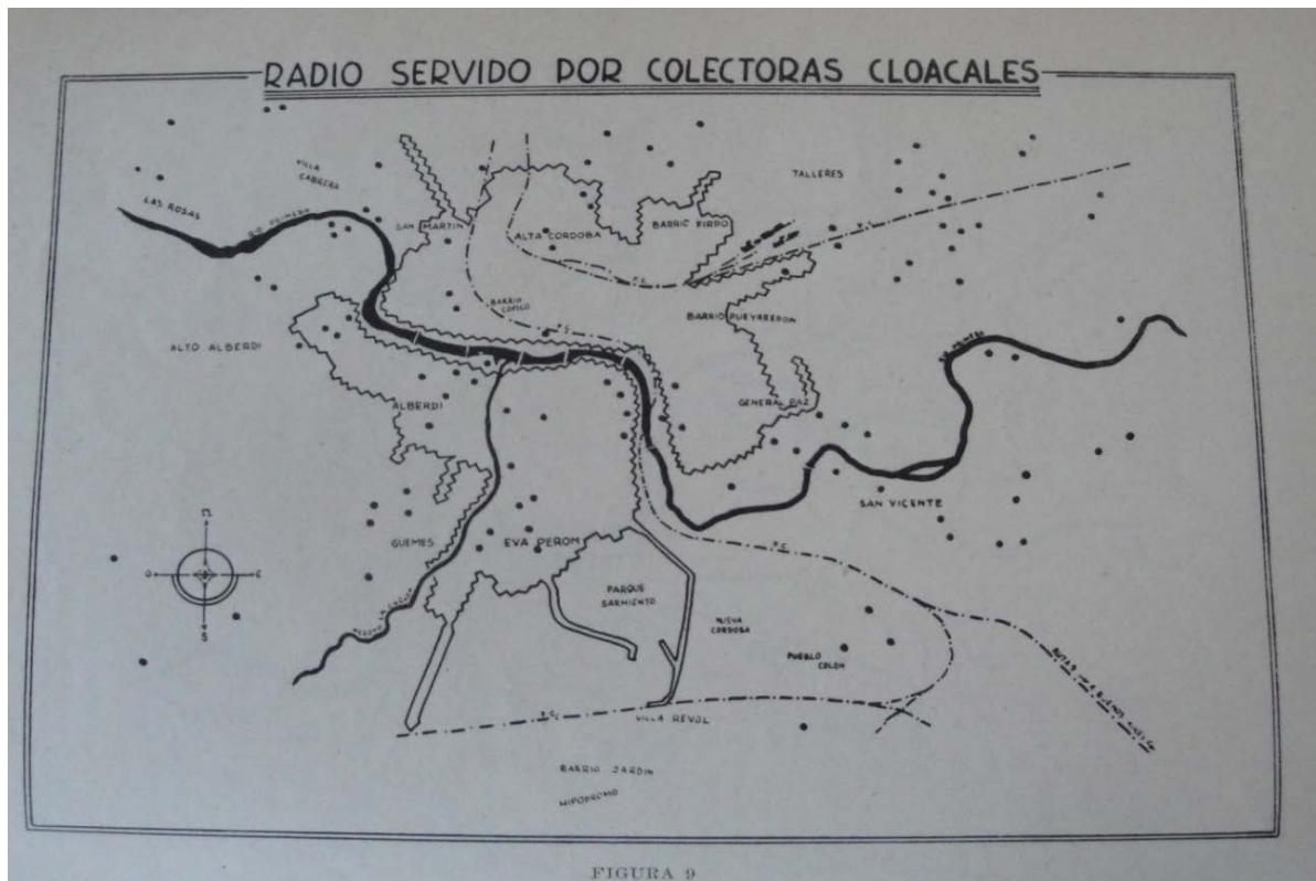
Map 2: Incidences of polio with the distribution of running water and sewage services in the city of Córdoba