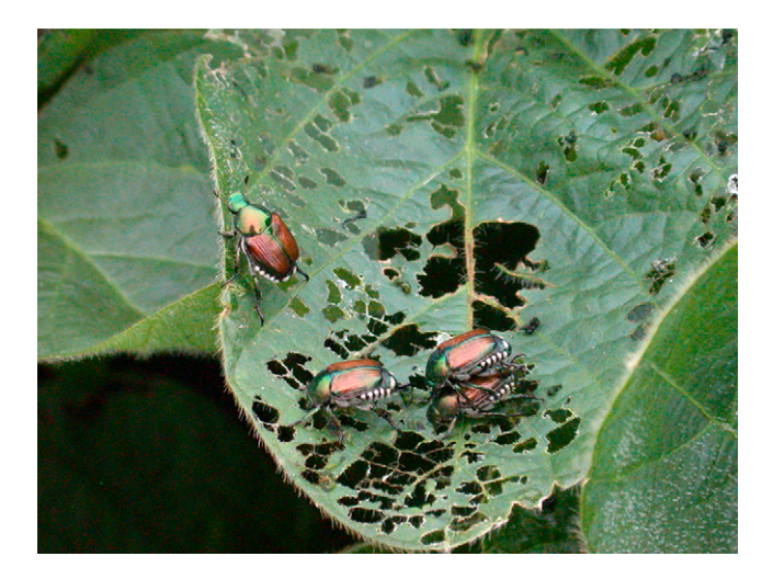
Figure 3. Japanese beetles feeding and mating on soybean grown under elevated CO_2 . Growth under elevated CO_2 increases leaf carbohydrates and reduces the concentration of defensive CystPI activity, which together greatly increase the suitability of foliage for beetles. Leaf damage and the number of Japanese beetles, as well as numbers of other folivorous insects, are greater in plots exposed to elevated compared with ambient CO_2 (Hamilton et al., 2005; Dermody et al., 2008).

The concomitant effects of elevated CO<sub>2</sub> on SA and JA/ET in soybean increased the concentration of SA-regulated phenolics, such as flavonoids with antioxidant properties (quercetin, kaempferol, and fisetin), but decreased the concentration of JA-regulated antiherbivore defenses, such as the isoflavonoid genistein