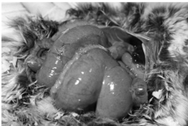
Figure 1. A severe case of tiflocolitis with meteorism by E. coli on a silver 11-month-old female.

The most common casualties were due by localized classical enteritis (i.e. catharral, fibrino-haemorrhagic or necrotic enteritis, tiflocolitis) (Figure 1). This group also includes those cases that showed other simultaneous digestive tract lesions, like meteorism or hepatic necrosis. The bulk of the animals were in poor body condition because of persistent diarrhoea. E. coli , Salmonella enterica subsp. typhimurium , arizonae and enteritidis , Pseudomonas aeruginosa , Yersinia pseudotuberculosis ,